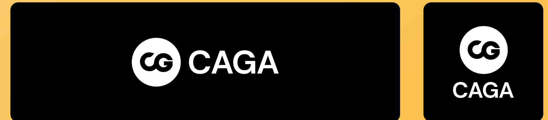
VERTICAL & HORIZONTAL