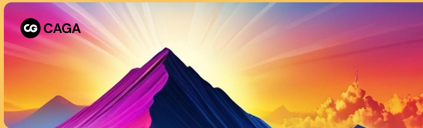
WITH LIGHT COMPLEX BACKGROUND