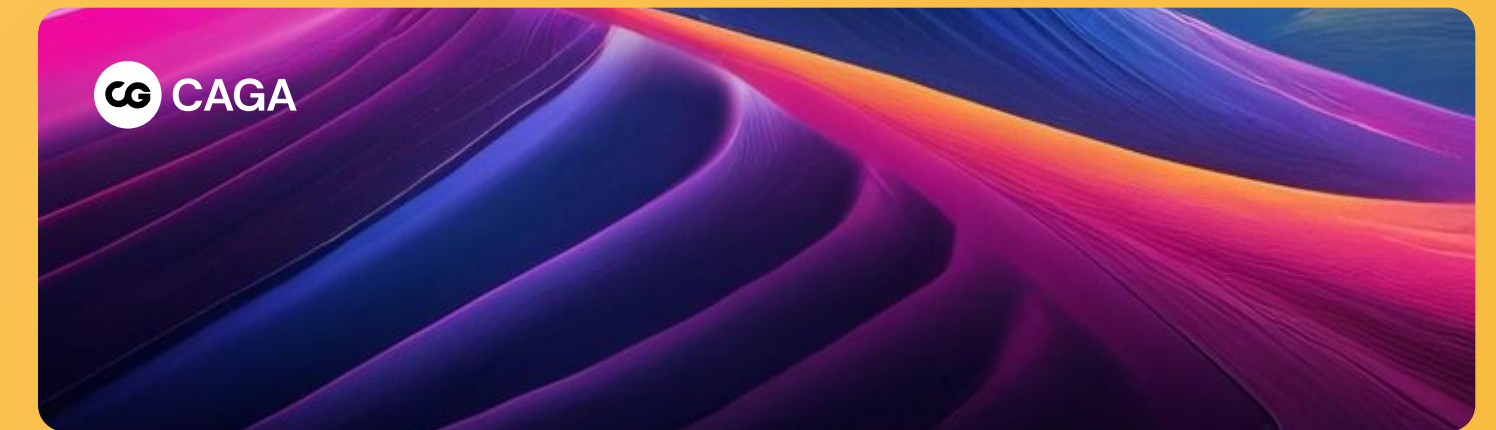
WITH DARK COMPLEX BACKGROUND