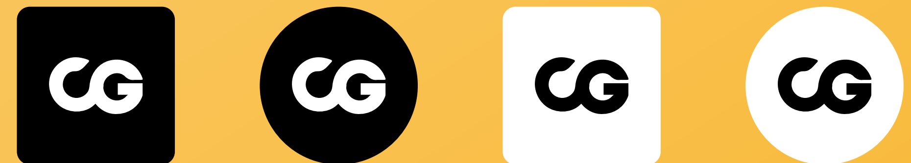
SOCIAL MEDIA PROFILE ICON